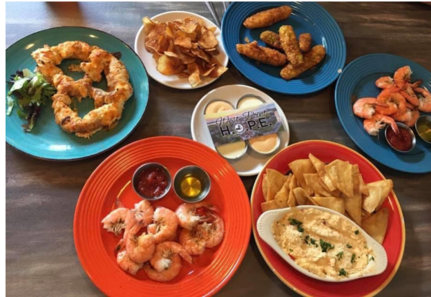
The Blue Crab of WP